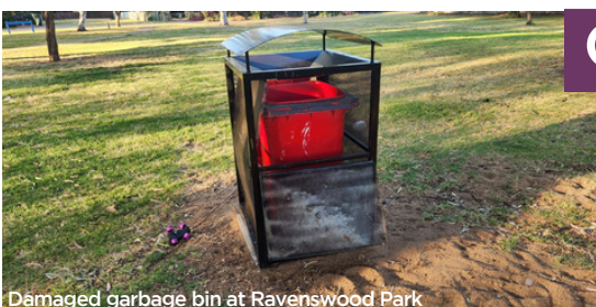
Damaged garbage bin at Ravenswood Park