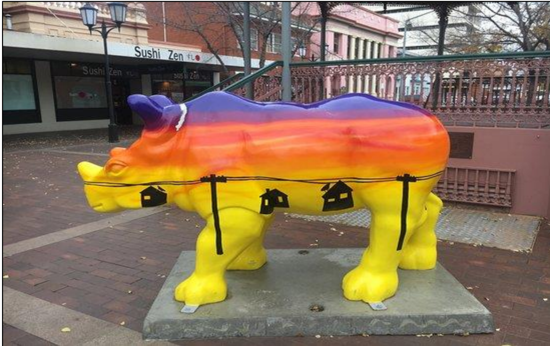
Hippo at Dubbo – TripAdvisor 2020.

Street Art can come in many forms and can range from street performers such as buskers, speaker's lectern, chalk sidewalk artists, permanent and static art works through to sculptures placed along the street areas.