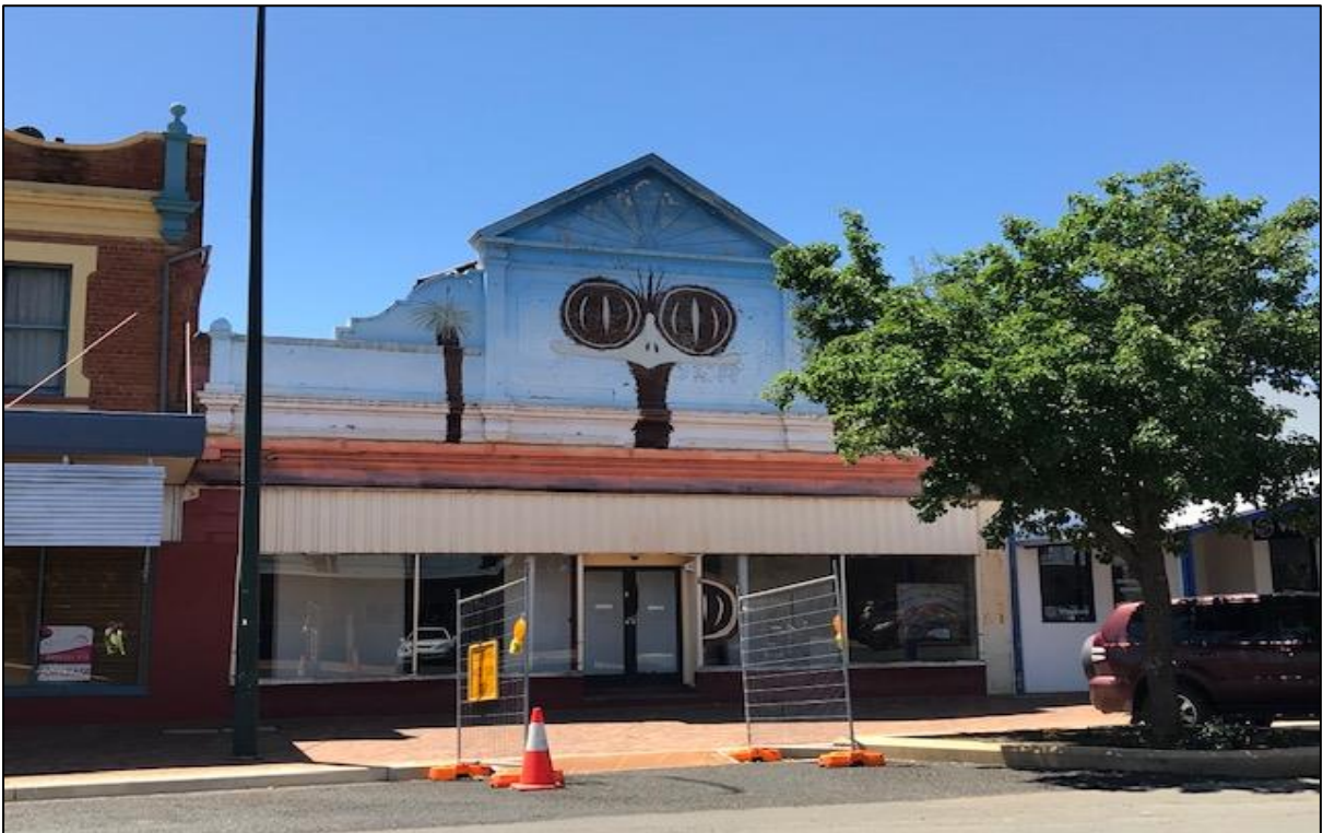
Emu Painted on what was once an art gallery and soon to be museum building