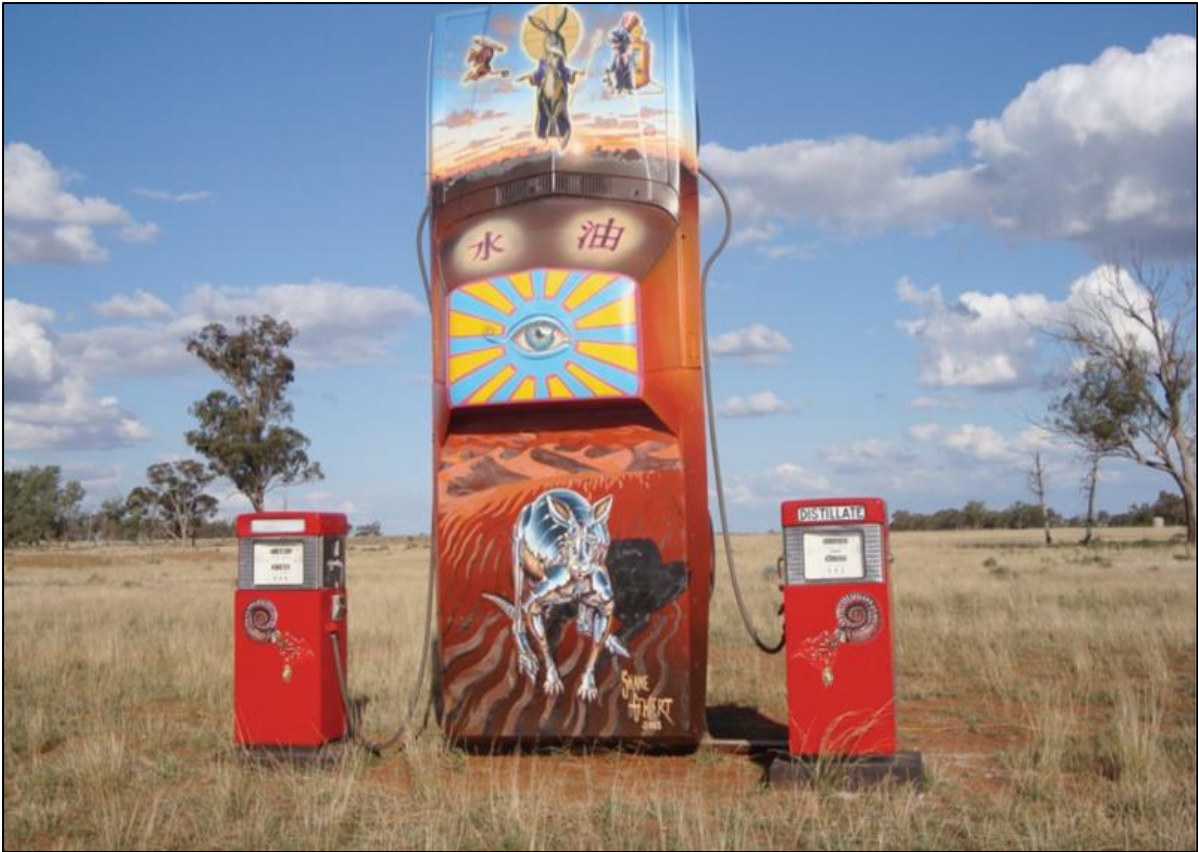
Utes in the Paddock at Condobolin.

The Warren community has an ability to develop a sculpture by the river event. This event would use the accessible footpath from Carter Oval through to Macquarie Park and around the river to the Warren Multipurpose Centre.