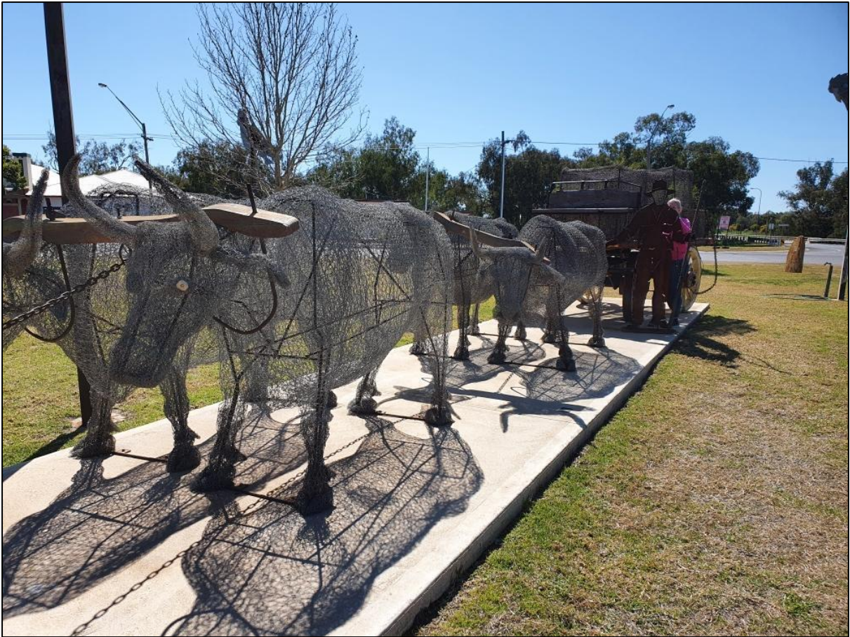
Rural sculpture at Gulargambone NSW, bringing local history alive in a rural village.

Cultural change has been developing over many years and progressive communities have been developing sculpture competitions that attract art works of many varying types that are displayed, promoted and used to enhance economic development.