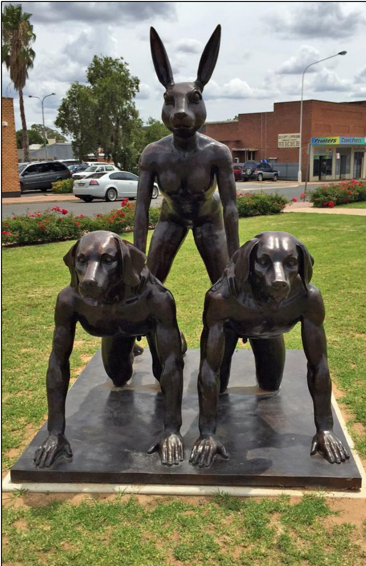
Dog and rabbit statue - Forbes Shire Council.

Street artworks include fixed items such as sculptures. These are visual attractants used to draw attention to a streetscape and they may be used as a unique visual feature such as the Dog and Rabbit statue in Forbes or they may be used to highlight past activities such as the butcher, baker, etc.