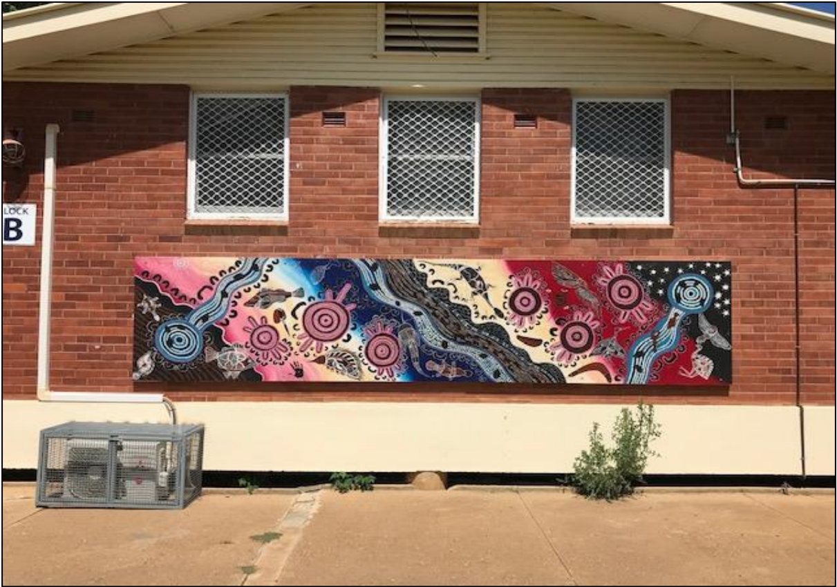
Mural painted on Block B at Warren TAFE – using artwork to brighten a plain brick wall.