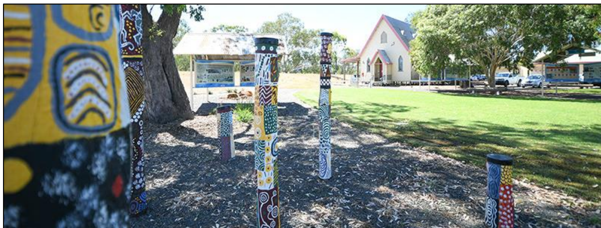
Cultural Art Display at WoW Centre. https://www.warren.nsw.gov.au/discover/window-on-the-wetlands-centre .

The community has several facilities that have been and are being used for art shows and meeting places. These have ranged from central main street areas, to the Warren Show, and the current art venue being the WoW Centre (Windows on the Wetland Centre) leased from Council by RiverSmart.