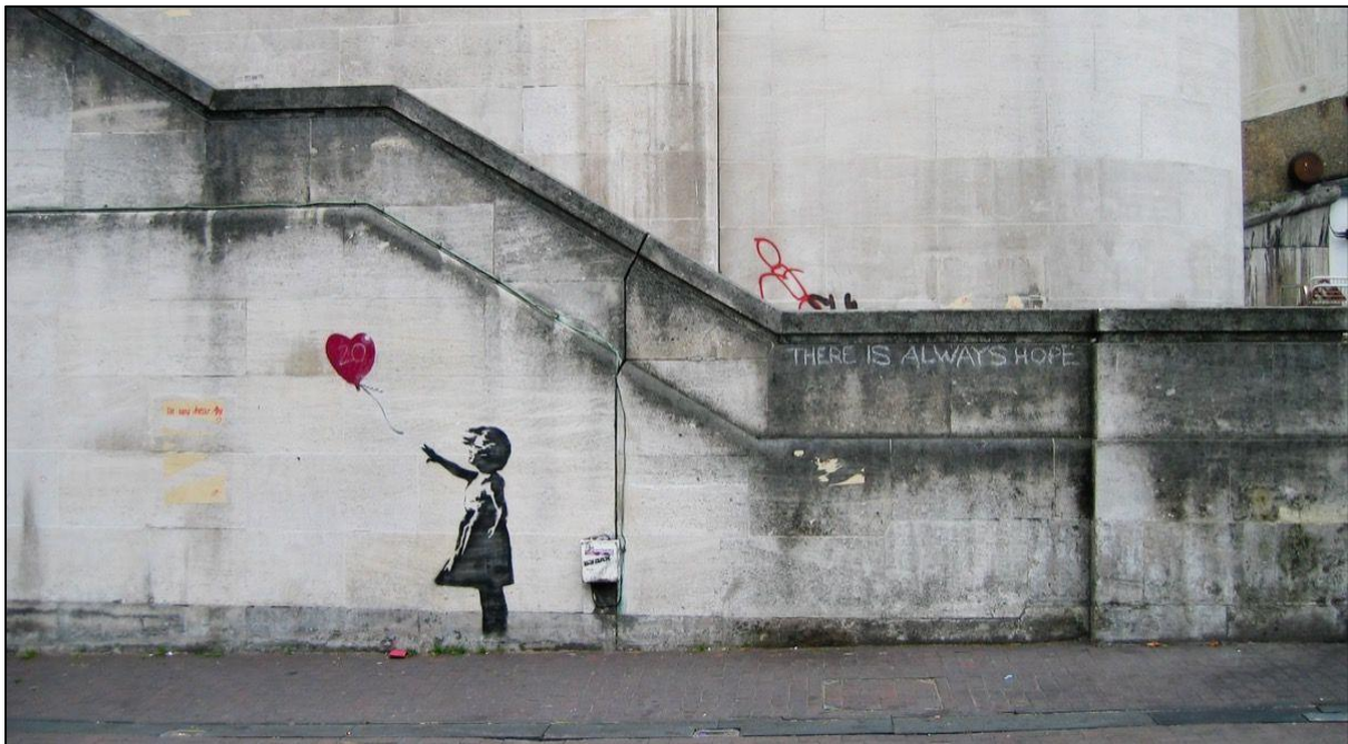
Banksy, Girl with Balloon. Photo by Dominic Robinson, via Flickr. https://www.artsy.net/article/artsy-editorial-6-iconic-works-banksy .

Banksy displays his art on publicly visible surfaces such as walls and self-built physical prop pieces. Banksy no longer sells photographs or reproductions of his street graffiti, but his public "installations" are regularly resold, often even by removing the wall they were painted on. Wikipedia, October 2020.