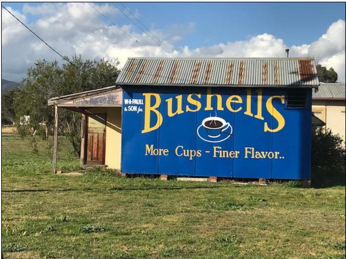
Busnell sign repainted at Moonbi NSW on a traditional store building.

Caution should be made in replication of these art forms across a commercial area, at it moves from a traditional feel to a manufactured feel with no historical background or vibrancy.