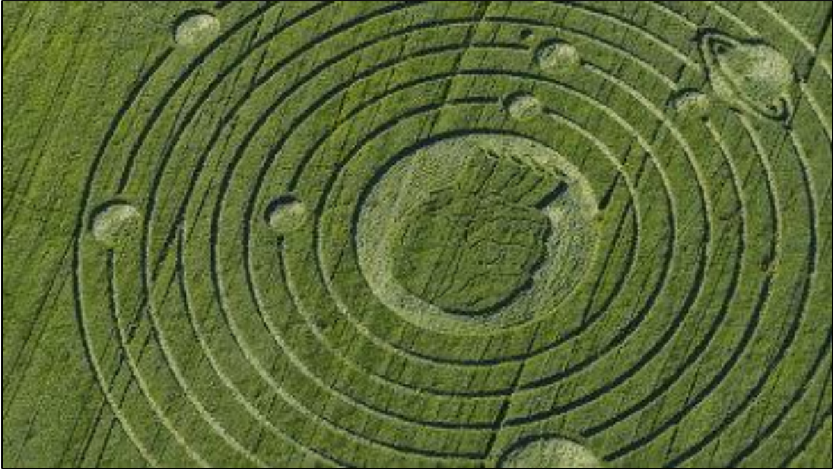
A crop circle in the Hunter Valley. Its design represents the position of the planets at the exact moment of our winter solstice in 2014. https://www.smh.com.au/national/architect-who-became-top-authority-on-mysterious-crop-circles-20200720-p55dqj.html

Landmark art works include place recognition and can include images, architectural designs and colours to attract attention and draw the visitor or resident into an area. Landmark art dominated the local landscape within the Wayilwan Nation prior to European arrival. The traditional Wayilwan people created public art in the form of carved trees. The complex designs, involved skill and strength and held unique and significant meaning for ceremonies and the commemoration of esteemed people within the nation who had passed away. There were thousands of such carved trees prior to European arrival. Examples of such local public art are held at the Warren Local Aboriginal Land Council.