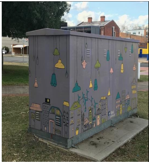
A plain electricity box outside Warren TAFE versus An electricity box in Tamworth. The rural urban art has turned an unattractive box into an artwork in the middle of a community space.