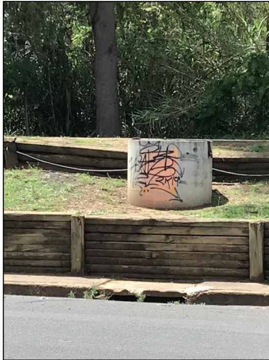
Graffiti in Warren along the proposed River sculpture trail.

Artwork developed and delivered by community organisations allow the community to make a difference to the town appearance, whilst providing valuable art training and skill development. Warren Shire is a sporting Shire but not all youth or adults are sports participants and struggle to fit within the sporting community. Alternate art forms such as urban art allows community participation.