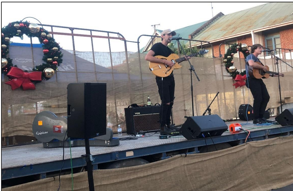
Music in Dubbo Street December 2018

Festivals and events should be targeted as much towards local residents as it is to attract tourists to ensure that everyone has an opportunity to participate in public arts events and seek enjoyment from the event.