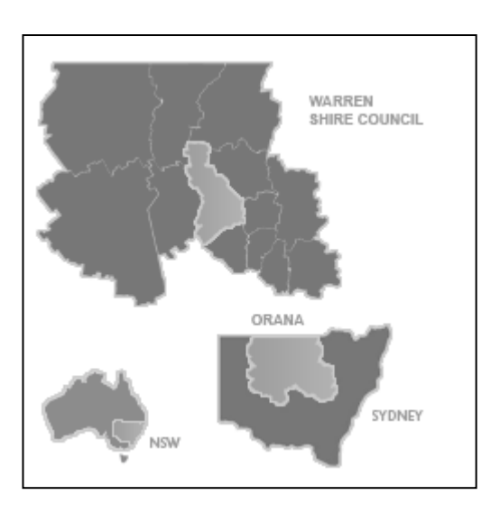
Local Government Area Map

The first European settlers moved into the area in the early 1830s taking up land, or "squatting" in the surrounding district, and Warren was gazetted as a town in June 1861. Prior to this settlement the sole owners and occupants had been the traditional custodians of the country, the Wayilwan / Weilwan people.